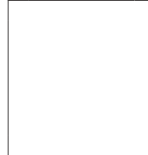
Right index fingerprint of alien removed

(Signature of alien being fingerprinted)